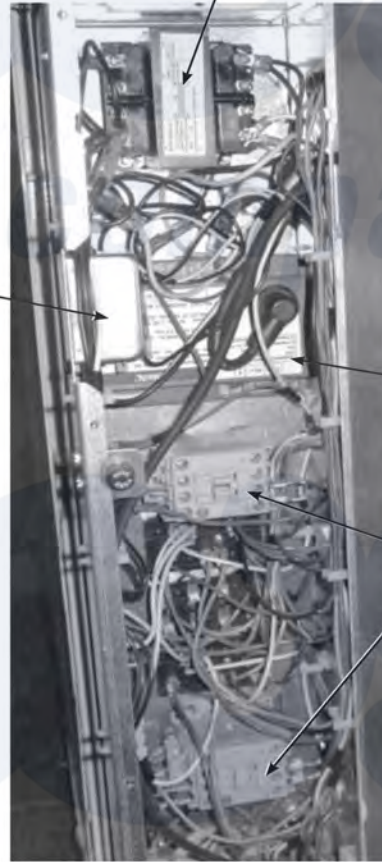
Dexter Commercial Dexter DDBD50KC Dryer Parts Parts Diagram Electrical Group Click on the part number to view part