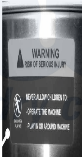
Risk of Injury Label