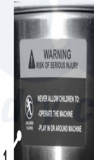
Risk of Injury Label