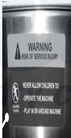
Risk of Injury Label